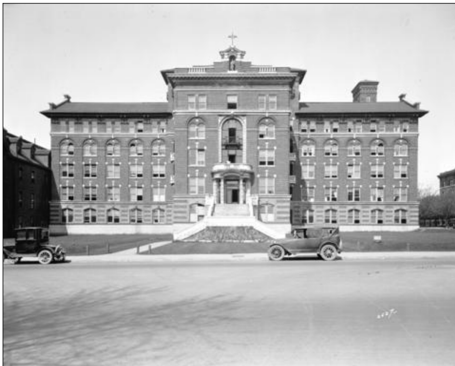
St. Paul's Hospital, Vancouver in 1935

Coeur, cran et intelligence: Perspectives historiques sur l'enseignement du nursing, sa pratique et l'esprit d'entreprise