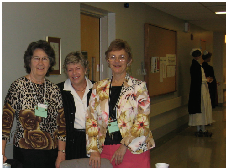
People in Attendance